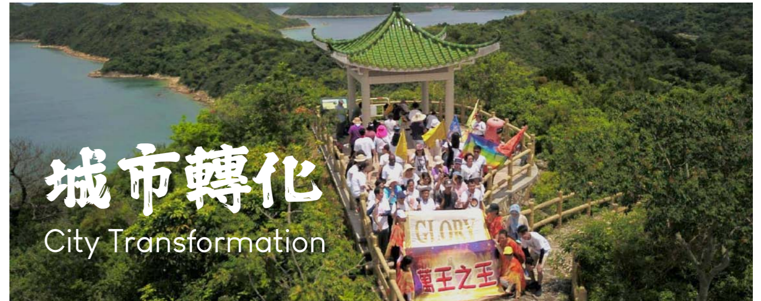
行區祈禱/高山祈禱——為香港認罪、爭戰、奪回地土歸神。 Prayer Walk/ Mountain Prayer — repent for HK, do spiritual warfare, take back the land, and return to God.